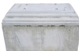
Basic Concrete Box

Dimensions: Inside 87"L x 30.5"W x 20"H (w/o lid)/ Outside 90.5"L x 34.25"W x 30"H