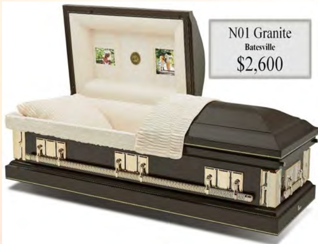
N01 Granite Batesville $2,600