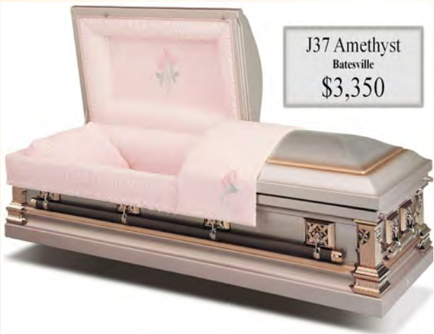
J37 Amethyst Batesville $3,350