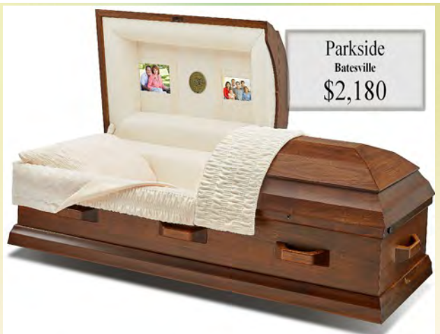
Parkside Batesville $2,180