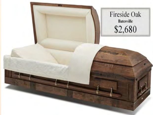
Fireside Oak Batesville $2,680