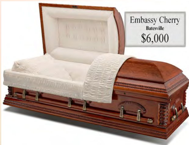
Embassy Cherry Batesville $6,000