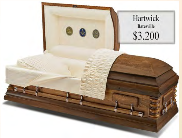
Hartwick Batesville $3,200