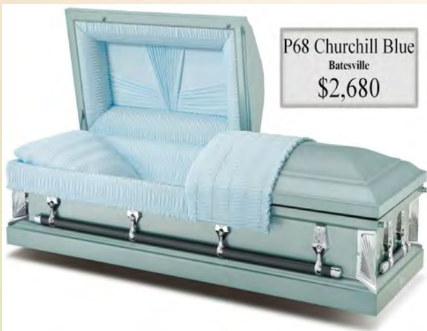
P68 Churchill Blue Batesville $2,680