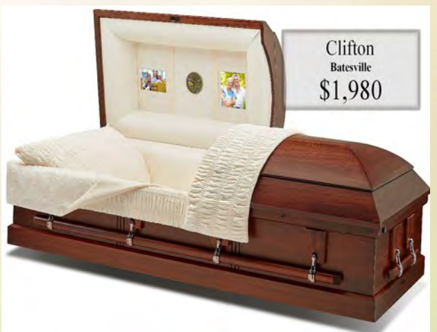
Clifton Batesville $1,980