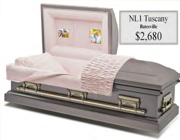
NL1 Tuscany Batesville $2,680