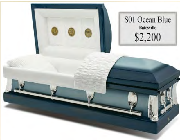
S01 Ocean Blue Batesville $2,200