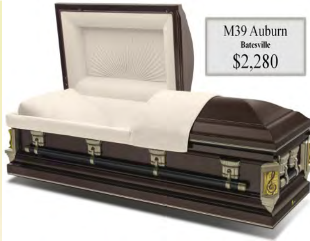
M39 Auburn Batesville $2,280