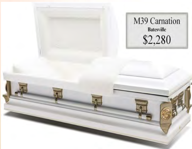
M39 Carnation Batesville $2,280