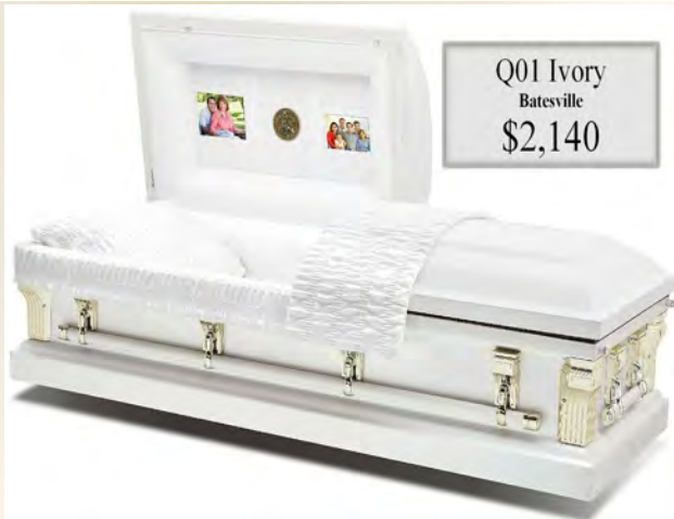
Q01 Ivory Batesville $2,140