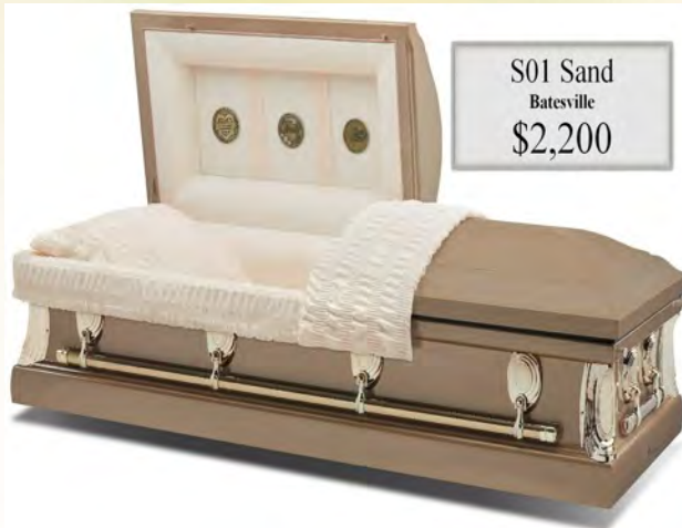
S01 Sand Batesville $2,200