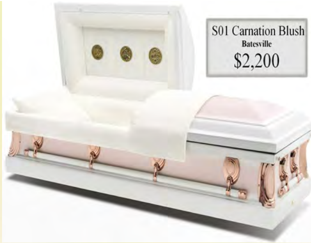
S01 Carnation Blush Batesville $2,200