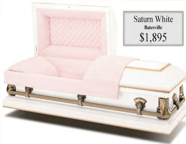
Saturn White Batesville $1,895