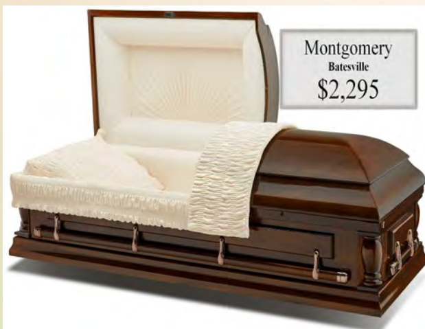
Montgomery Batesville $2,295