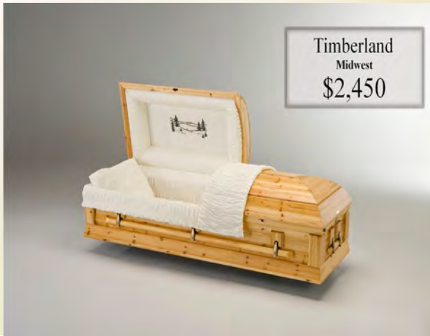
Timberland Midwest $2,450