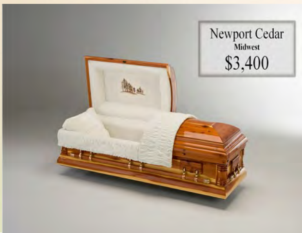
Newport Cedar Midwest $3,400