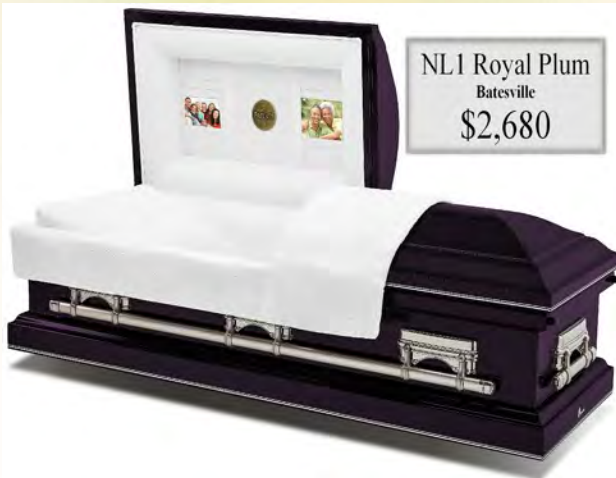
NL1 Royal Plum Batesville $2,680