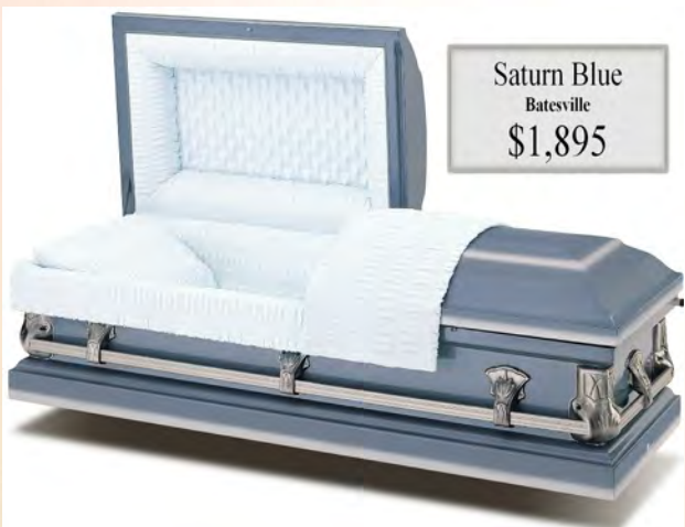
Saturn Blue Batesville $1,895