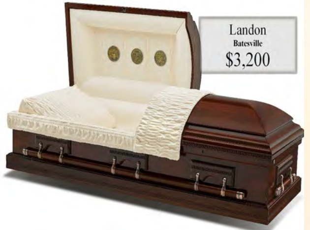
Landon Batesville $3,200