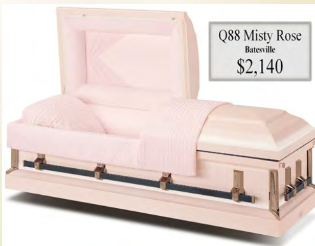
Q88 Misty Rose Batesville $2,140