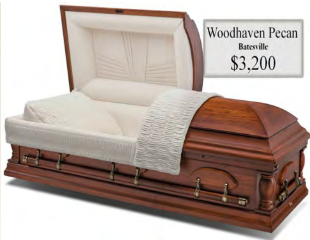
Woodhaven Pecan Batesville $3,200